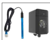
pH kit as standard