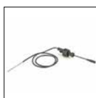
Flow switch included