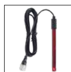
Redox probe kit as standard